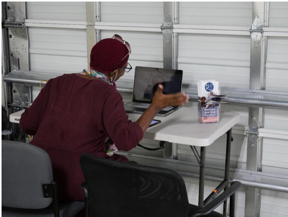
Client speaks with a remote attorney for assistance with an eviction.