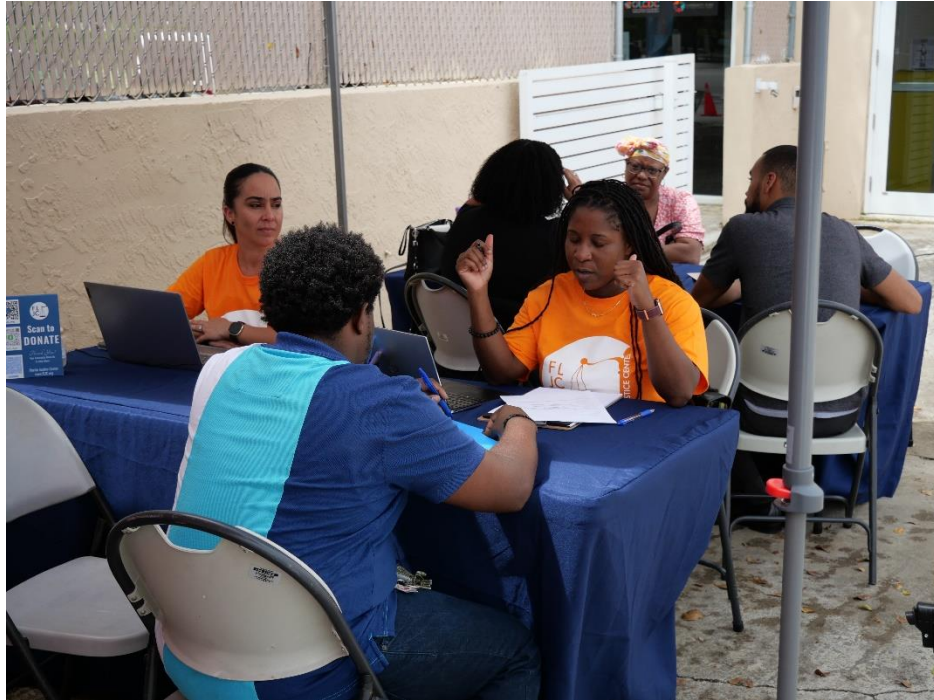
Florida Justice Center staff and volunteers meet with clients at the Opa-Locka Community Development Corporation to assist them with legal needs