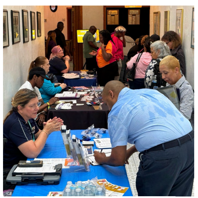
Attendees braved the rain to meet with lawyers and social service providers.