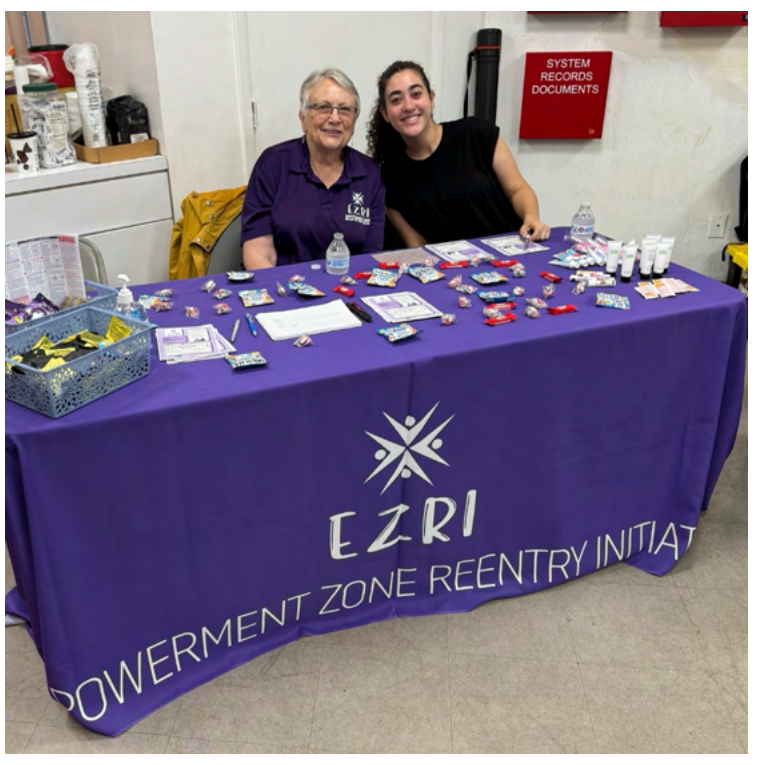
Social service organizations provided information, goodie bags, and services onsite to those in need of help.